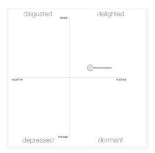
Figure 2. Affect Orientation of Personal Confidence Narrative in the UK (Dec 2022)

In contrast to Japan, in December 2022, the Personal Confidence narrative was transformational. Affect orientation is a measure of the degree to which the narrative stimulates an emotional response: active or passive, positive or negative. Its' affect orientation conveyed a sense of delight being both active and positive (Figure 2) so has momentum. Significantly the emotional response of the narrative is largely positive (Figure 3).