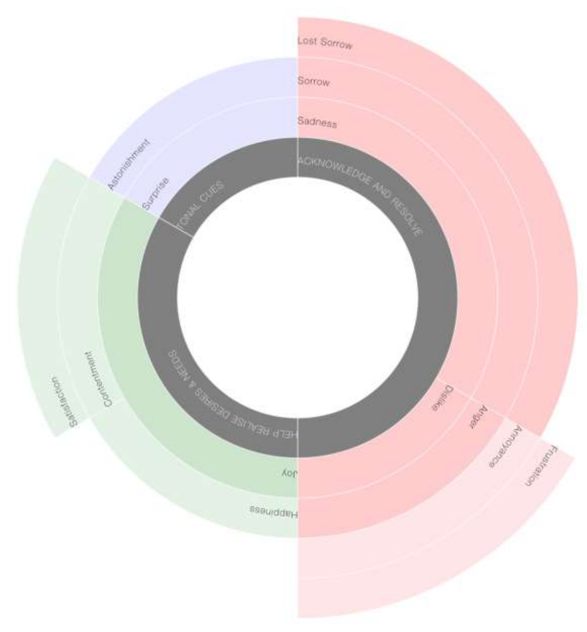
Figure 9 Emotional Response of Personal Activity Narrative in Japan (Dec 2022)

In the UK, the narrative classification of the Personal Activity narrative is on the border of being transformational and tribal (Figure 10). Verging on being tribal, most of this debate has no impact. Far less than one percent of content in such a narrative, will have any significance. Although it is easy to be a participant, it is far more difficult to be a player or leader in such narratives. This narrative shows mass participation, but its content is poorly defined. Nobody is quite sure what the conversation is really about. Nor, does the majority of existing content successfully provide definition or focus. Whilst there's a lot of buzz, there is a lack of clear direction. The affect orientation is strongly positive but somewhat passive. Narratives such as this, which are driven by a passive, positive engagement, are often long-lived, but are vulnerable to apathy and unanticipated disruption. They may not have the strength to survive rapid transformative change.