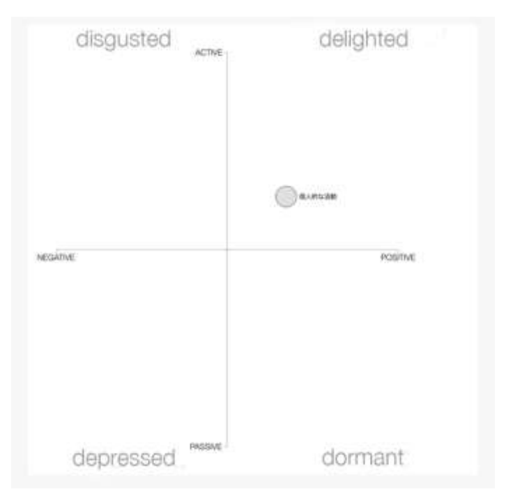
Figure 8. Affect Orientation of Personal Activity Narrative in Japan (Dec 2022)

On the other hand, the Personal Activity narrative, in Japan, is both transformational and has momentum since its affect orientation is active and positive (Figure 8). That said, there remains some negative emotions coming out of the national emergency with a genuine sadness in daily life and a frustration leading to dislike. Coming out of the pandemic it is critical to be positive and within the narrative this is conveyed most meaningful by a need to create a sense of 'team'. These positive aspects of team driving the narrative, are fueled by news.livedoor.com being by far the most powerful media.