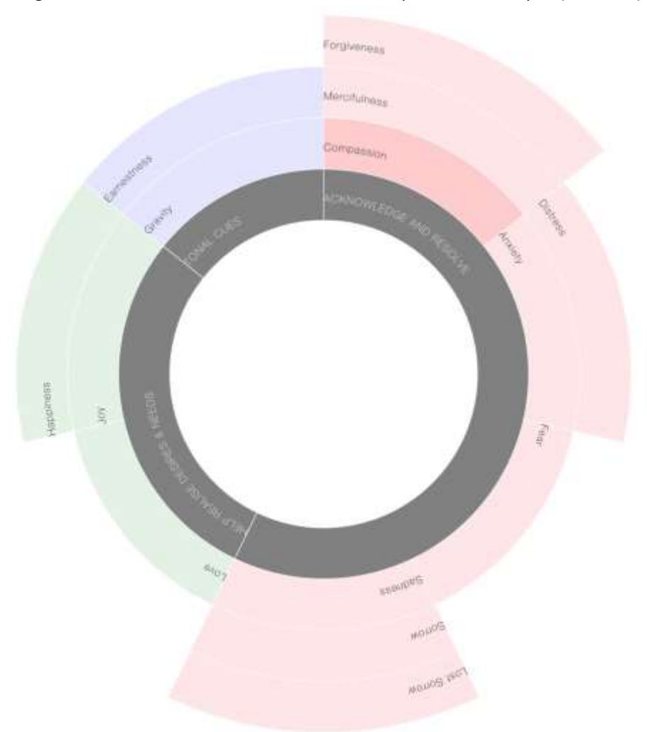
Figure 6. Emotional Response of Personal Friendship Narrative in Japan (Dec 2022)