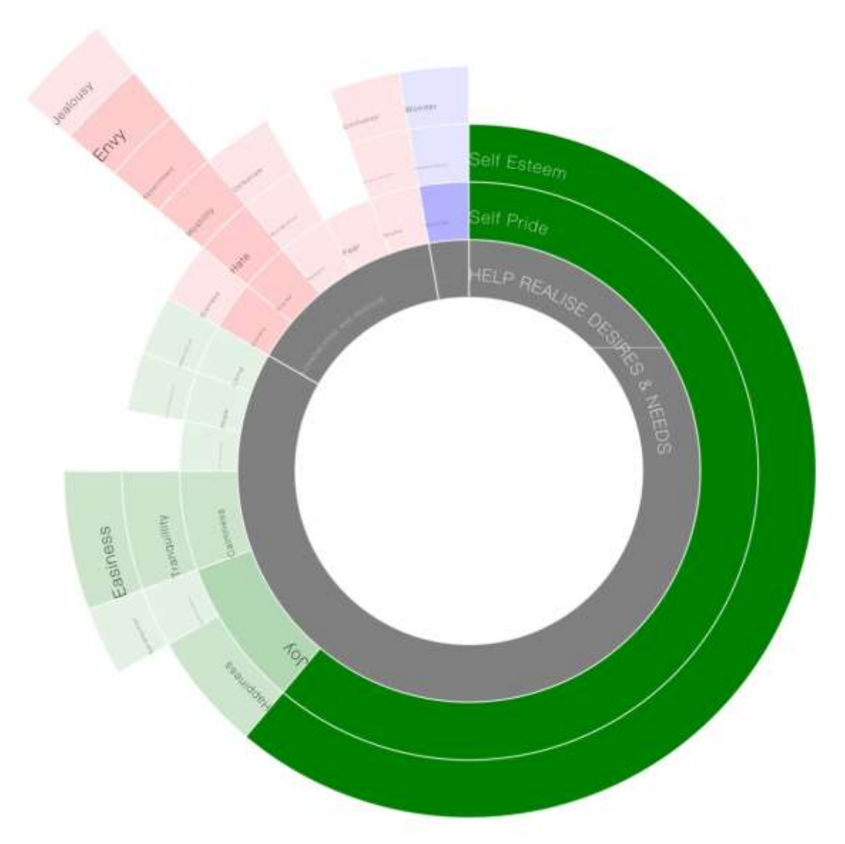
Figure 3. Emotional Response of Personal Confidence Narrative in the UK (Dec 2022)

associated with Personal Confidence in Japan at the same time (Beaumont et al., 2023). The media driving the Personal Confidence narrative are multi-dimensional in their nature reflective of a re-evaluation of work-life balance, personal development, well-being as people reassess what is important. Critically the focus on self-improvement is a realisation that new capabilities can enhance performance and confidence. This is illustrated in Figure 4.