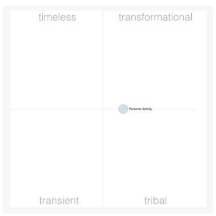
Figure 10. Narrative Classification of Personal Activity Narrative in the UK (Dec 2022)

The emotional response of the Personal Activity narrative, as noted above, is wholly positive with satisfaction bringing contentment and joy. That said, the intensity of the emotions are quite weak. The media that drives the narrative focuses on personal growth through self-development with a focus on business growth (cf. Inspiring Founders event accessed via LinkedIn).