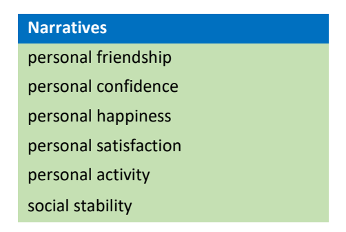
Table 3: Transformational Narratives in the UK in December 2022

In contrast to Japan, in December 2022, the Personal Confidence narrative was transformational. Affect orientation is a measure of the degree to which the narrative stimulates an emotional response: active or passive, positive or negative. Its' affect orientation conveyed a sense of delight being both active and positive (Figure 2) so has momentum. Significantly the emotional response of the narrative is largely positive (Figure 3).