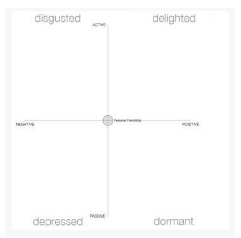
Figure 7. Affect Orientation of Personal Friendship Narrative in the UK (Dec 2022)

On the other hand, the Personal Activity narrative, in Japan, is both transformational and has momentum since its affect orientation is active and positive (Figure 8). That said, there remains some negative emotions coming out of the national emergency with a genuine sadness in daily life and a frustration leading to dislike. Coming out of the pandemic it is critical to be positive and within the narrative this is conveyed most meaningful by a need to create a sense of 'team'. These positive aspects of team driving the narrative, are fueled by news.livedoor.com being by far the most powerful media.