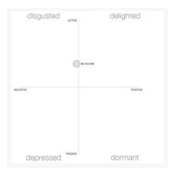
Figure 5. Affect Orientation of Personal Friendship Narrative in Japan (Dec 2022)

measures, so currently this transformational narrative has an emotional response more usually associated with a transient narrative.