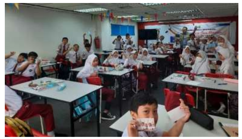
Figure 5: The atmosphere in the classroom after thefocus group discussion.

• In this activity, the community service team provides aguidebook containing guidelines for implementing social awareness learning as a guidebook for long-term sustainability in the realization of social awareness on the use of gadgets.