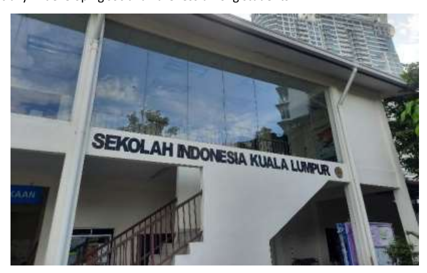
(Figure 1, Indonesia School Kuala Lumpur in the area of the Indonesian Embassy)

Children today tend to be more attached to theirgadgets than interacting with friends or family. They feel uncomfortable if they cannot use electronic devices for daily activities, such as eating, dressing, playing games ordoing homework. This shows that these children are starting to experience gadget dependency, which reduces their social interaction with peers and family. This problem impacts their social aspects, making it important for Generation Alpha to receive character education. Character education will have a positive influence, especially in developing social awareness among students.