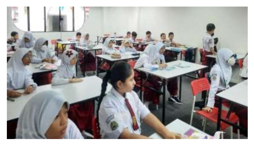
Figure 2: The atmosphere in the classroom at Indonesianschool in kuala lumpur

The implementation of community service activities tookplace at the Indonesian School in Kuala Lumpur which is located in the Kuala Lumpur Embassy of the Republic of Indonesia (KBRI) area, as in the process of implementingthe service involving 5th grade elementary school students and several teachers, this activity was very well responded by the students, several activities such as image simulations about addiction to using Mobile Phones to students became interesting things in the service process because students could see firsthand the consequences of gadget addiction and how to respect social conditions such as parents and teachers and the community environment when using gadgets.