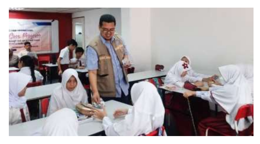
Figure 3: The atmosphere when simulating social conditions based on images and QR codes

At this stage, the PKM team provides an explanation related to the state of Basic Social and Culture when students use gadgets, Knowledge and understanding basic social and culture is very important in the current era. Having a good social understanding, both in individuals and groups, can have a positive impact not only for oneself, but also for those around. This understanding will affect one's way of life, starting from a more comfortable life in cyberspace and transforming into a more comfortable life by interacting with people around and socializing so that when students are in a social environment they can use gadgets more wisely, such as when they are in the home environment, the activities they do are more interacting with other family members.