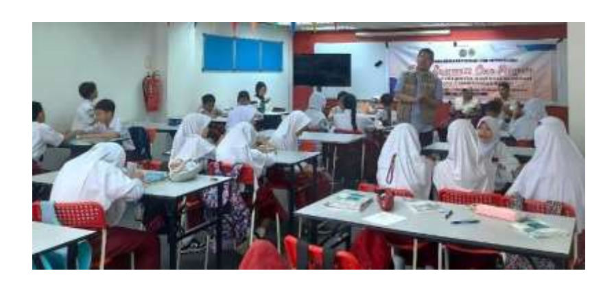
Figure 4: The atmosphere of the presentation related to the alpha generation and Education 5.0

• Alpha Generation and Education 5.0 presentation, In this process, it was explained that GenerationAlpha needs to focus on three important things inwelcoming a better education, namely building self- concept, social awareness, and a developed mindset. Therefore, in our service delivery method, these three things become the main focus, especially for Generation Alpha. Today, the biggest challenge for them no longer comes from others, but rather from alack of social sensitivity and the impact of increasingly rapid global development.